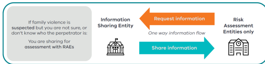
Figure 1: Overview of activities when sharing information for risk assessment

Family violence risk assessment is an ongoing process and is required at different points in time from different service perspectives. Education and care services will have a role in working collaboratively with other services to contribute to ongoing risk assessment and management of family violence.